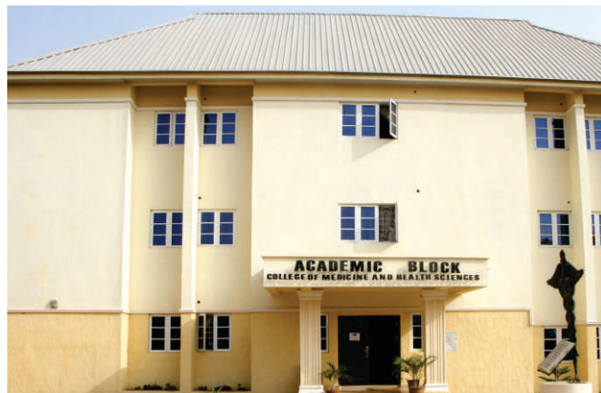
College of Medicine and Allied Health Sciences (Academic Building) Jos Campus