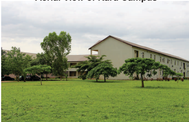
College of Medicine and Allied Health Sciences Karu Campus