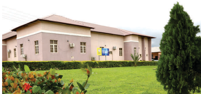
Faculty of Science and Technology