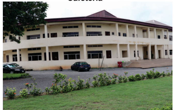
Faculty of Environmental Sciences