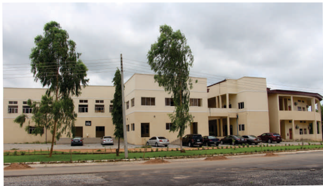
Faculty of Law